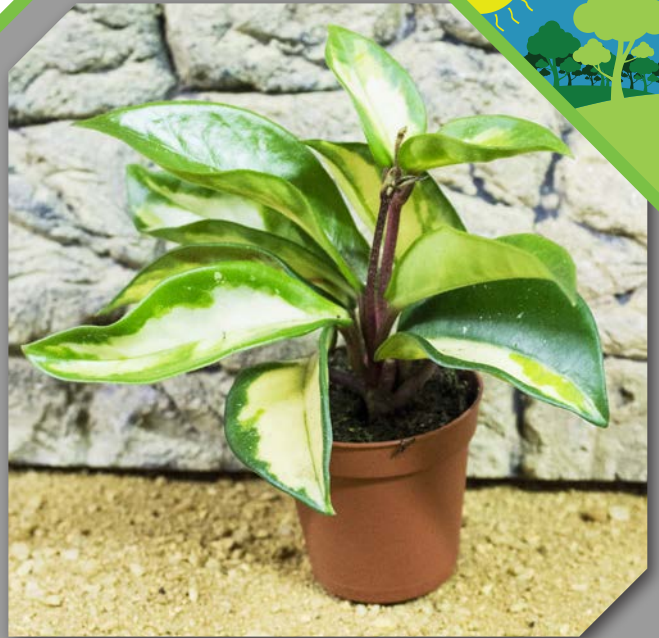
Wax Plant - Hoya tricolor

Prefers bright light, but will tolerate some shade. Climbs and will produce fragrant flowers. Allow the top of the soil to dry out before watering if needed. Will tolerate drought.