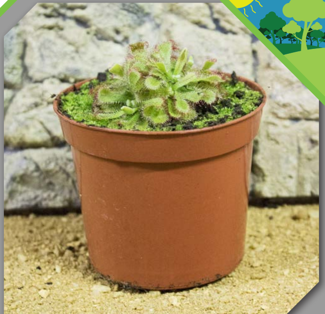
Sundew - Drosera aliciae

Needs very good light and soil that is permanently damp. Place pot in dish with 1cm of rainwater. Will not tolerate hard water. Keep cool in winter.