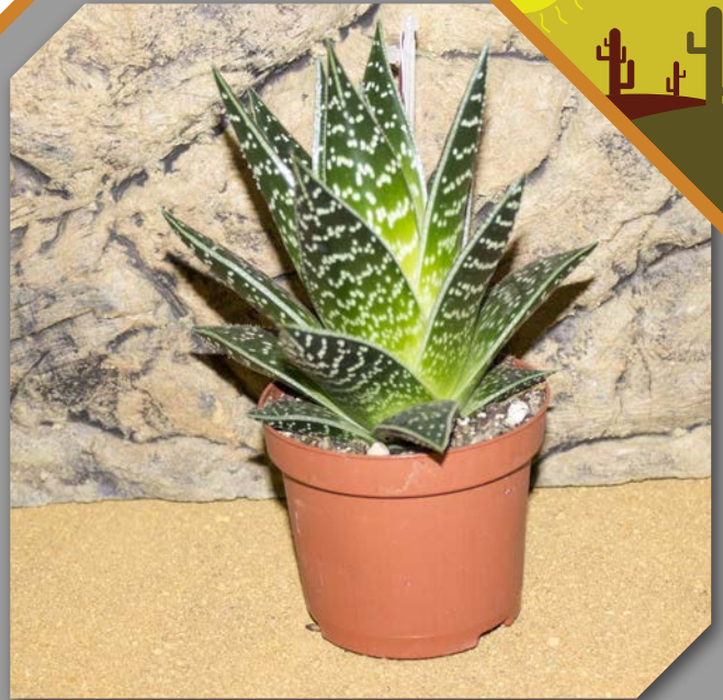
Aloe variegata - Aloe tiki tahi

Rosette forming plant for dry environment. Leaves are often hairy when small. Needs well drained soil. Drought tolerant but prefers to be kept slightly damp. Needs bright light.