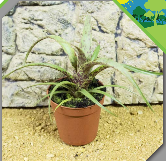
Epiphytic Bromeliad - Vriesea saundersii

Grown in bright light, but avoid direct, hot lamps which will scorch the leaves. Keep central well full of water. Need well drained soil and high humidity.