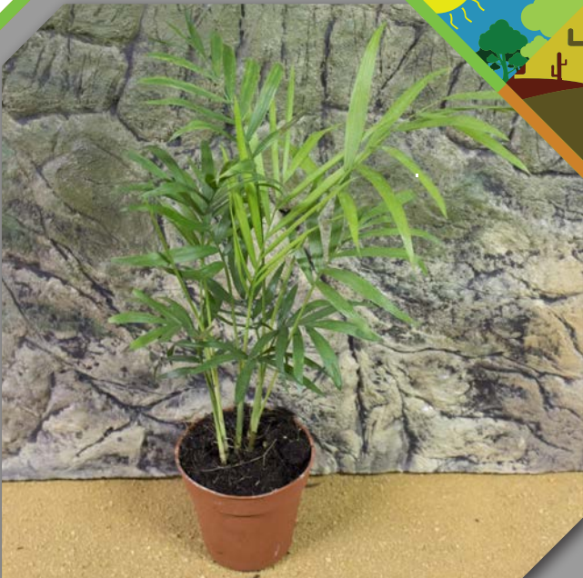
Parlour Palm - Chamaedorea

This slow growing palm will tolerate a wide range of conditions. Grown in moist or dry soils but avoid extremes. In low light it is very slow growing.