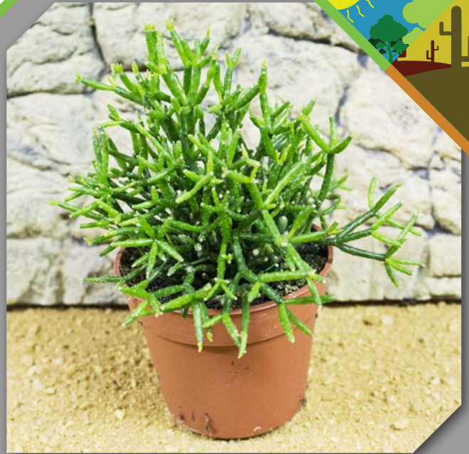
Drunkards Dream - Hatiora salicorniodes

An interesting epiphytic cactus for larger terrariums. The trailing fronds of this cactus are shown best if grown epiphytically, but it will grow in any position in a well drained soil. Needs light shade. Tolerates some drought.