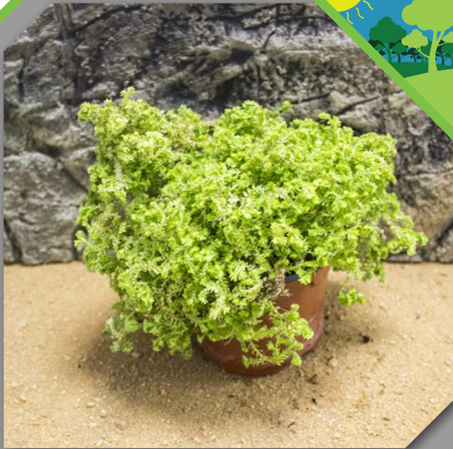
Spikemoss - Seliginella Sp.

Can only be used in damp terrariums as they must have a constantly damp soil and high humidity. Given these conditions then they will tolerate bright light or light shade but must not be exposed to drying.