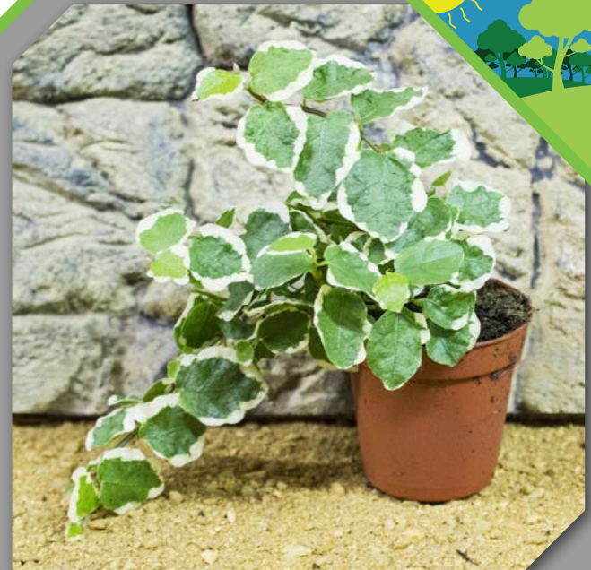
Creeping Fig - Ficus pumila

Suitable for ground or wall cover Ficus grows quickly, attaching with small rootlets. Tolerates a wide range of light and moisture but prefers bright, damp conditions.