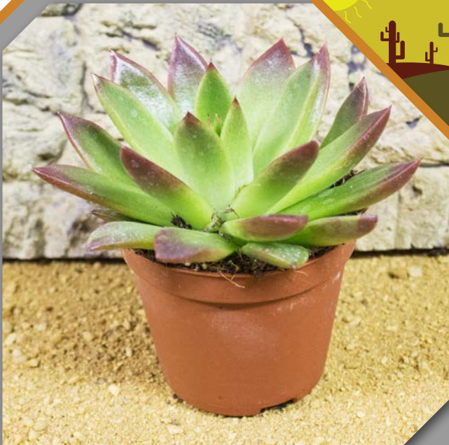
Ebony Wax Agave - Echeveria ebony

Rosette forming plant for dry environment. Needs well drained soil, keep slightly damp. Needs bright light which brings out colours.