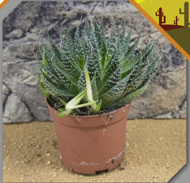
Lace Aloe - Aloe aristata

A robust, clump forming Aloe for dry environments. Plant in well draining soil and keep roots slightly damp. Requires good light.