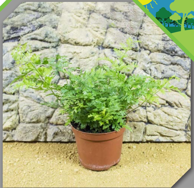
Rabbits Foot Fern - Davalia fern

This fern grows best as an epiphyte and required high humidity. The soil should be evenly moist but not wet. Do not expose to heat or very bright light as the leaves will scorch.