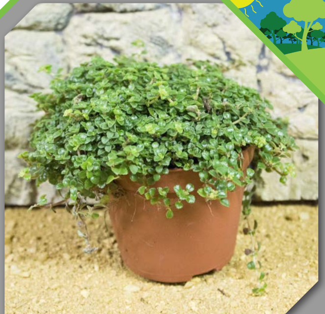
Mind Your Own Business - Soleirolia soleirolii

Creeping ground cover plant. Needs high humidity, constantly moist soil and bright light.