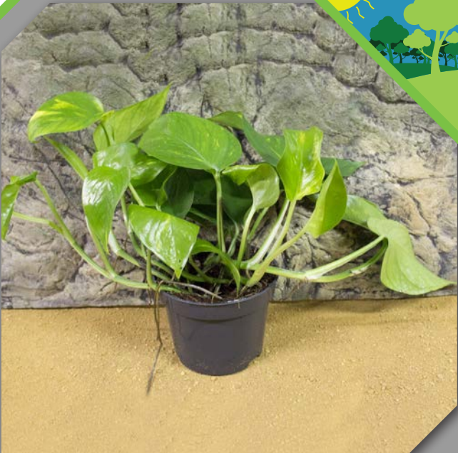
Devils Ivy - Epipremnum aureum

Devils Ivy will grow in a wide range of light and moisture conditions, but will not tolerate permanent dry conditions though. Without a doubt it does best in a moist, humid terrarium with good light.