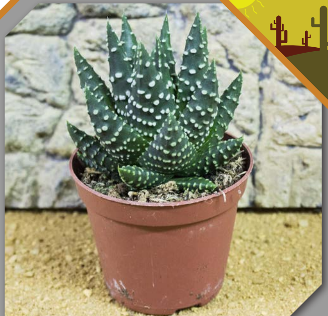
Pearl Plant - Harworthia margaritafera

Tall upright rosettes which form clumps over time from offshoots. Very drought tolerant, water when soil is almost dry. Tolerant of lower light.