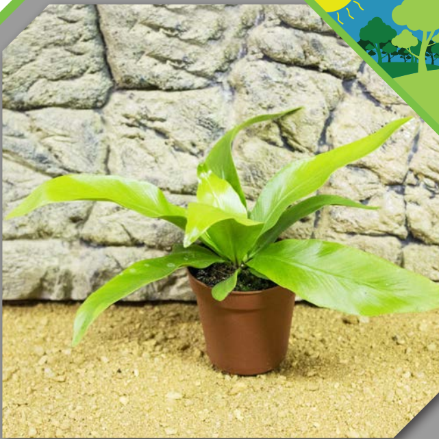
Bird Nest Fern - Asplenium antiquum

Best grown as an epiphyte, but will grow terrestrially as long as it is not waterlogged. Tolerates bright light or shade but avoid direct heat from lamps.