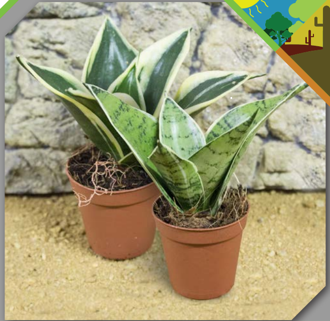
Tiny Sanny - Sansevieria

Use in dry environments, or forest tanks where the soil can be kept on the dry side. Tolerates bright light, or some shade.