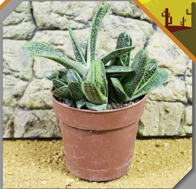
Warty Gasteria - Gasteria "little warty"

Succulent for dry environments. Forms large clumps over time from offshoots. Drought tolerant and can grow in partial shade.