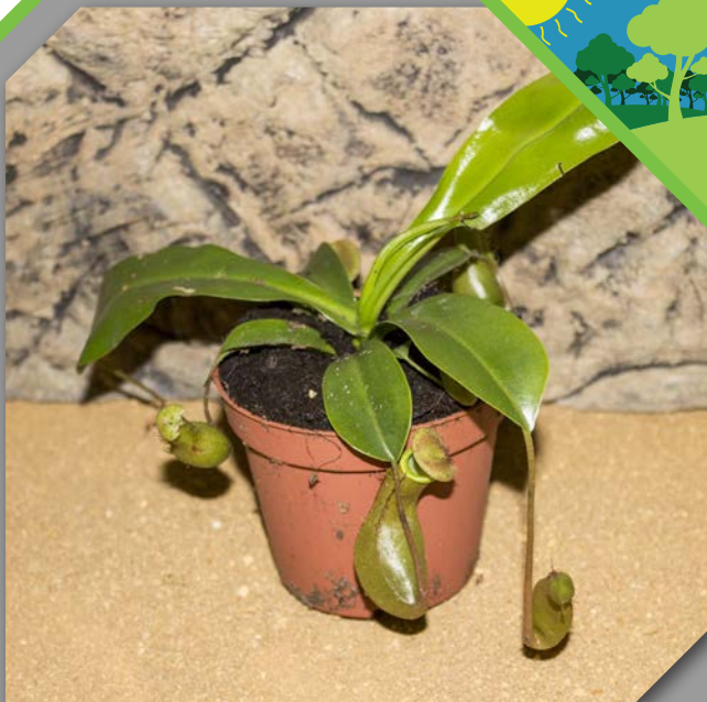
Monkey Cup - Nepenthes alata

Needs a free draining, but constantly damp, slightly acidic soil together with bright light and high humidity. Given the right conditions they will grow long scrambling stems with each leaf having a dangling trap on the end.