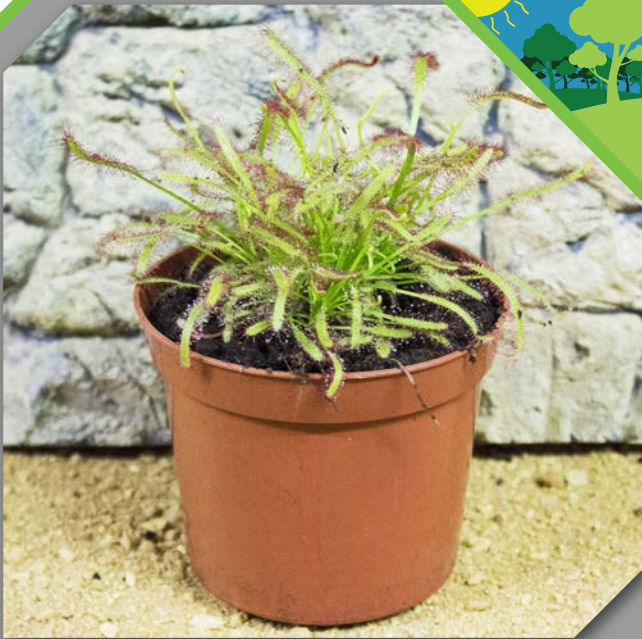
Cape Sundew - Drosera capensis

Needs very good light and soil that is permanently damp. Place pot in dish with 1cm of rainwater. Will not tolerate hard water. Keep cool in winter.