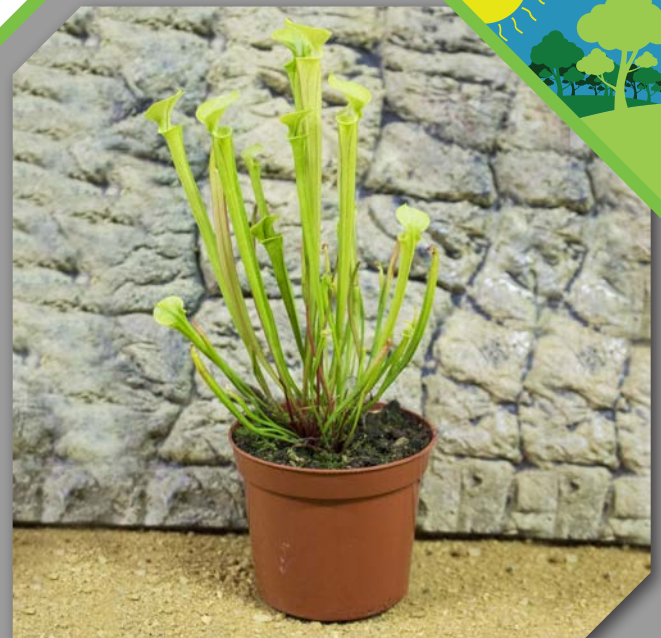
Pitcher Plant - Sarracenia Flava

Needs very good light and soil that is permanently damp. Place pot in dish with 1cm of rainwater. Will not tolerate hard water. Dies back in winter.