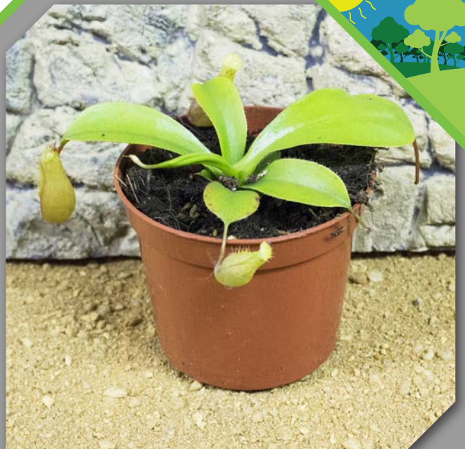
Monkey Cup - Nepenthes alata

Vigorous climber that does well in the terrarium. Needs well drained soil that is permanently damp and bright light, avoid direct heat. Needs high humidity.