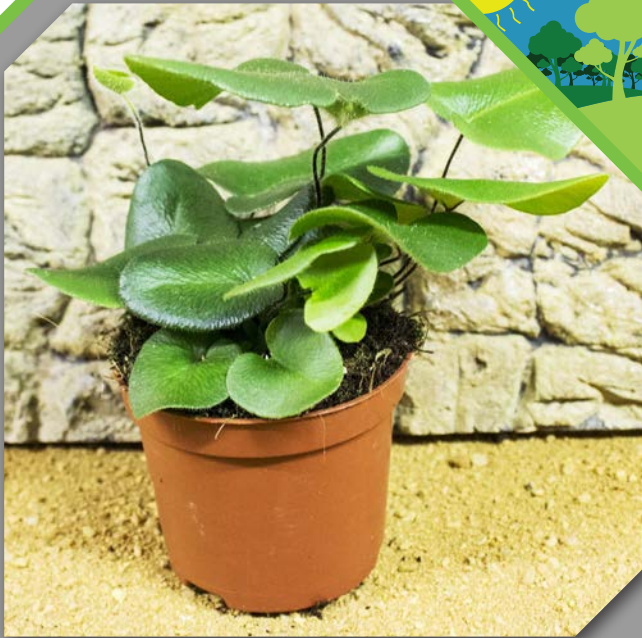
Heart Fern - Hemionitis arifolia

The fern will grow as an epiphyte, or in well drained, but damp soil. Prefers shady conditions.