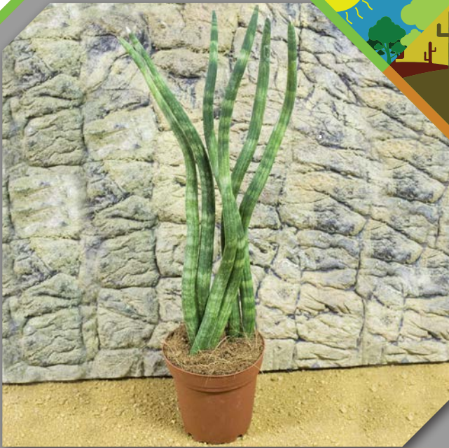
Snake Plant - Sansevieria mikado

Use in dry environments, or forest tanks where the soil can be kept on the dry side. Tolerates bright light, or some shade.