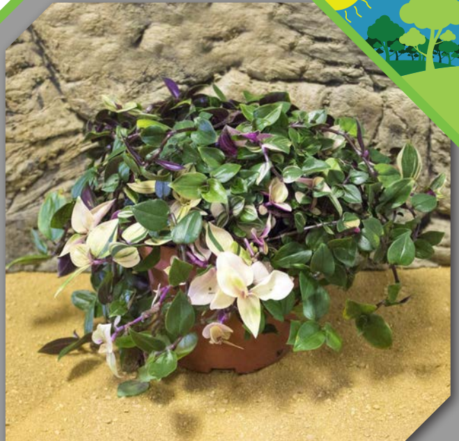
Wandering Jew - Tradiscantia

This pretty creeper brings some colour to the terrarium. It needs bright light to maintain its colour and high humidity. The soil needs to be evenly damp and well drained so that the roots are not permanently wet.