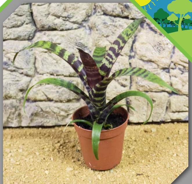
Flaming Sword - Vriesea fire

Grown in bright light, but avoid direct, hot lamps which will scorch the leaves. Keep central well full of water. Need well drained soil and high humidity.