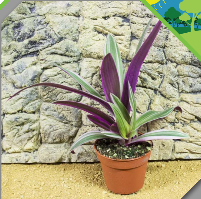
Moses-in-the-Cradle - Rhoeo discolor

Compact, upright habit which is ideal as a backdrop. Needs medium to high humidity and evenly moist well drained soil in bright light. Do not make too wet. Avoid contact with sap.