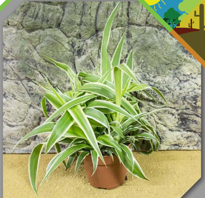
Spider Plant - Chlorophytum

Grows into a large clump, with arching stolon's with new plants attached. Will tolerate a wide range of moisture and light conditions. Position at the top of a terrariums for the best effect.