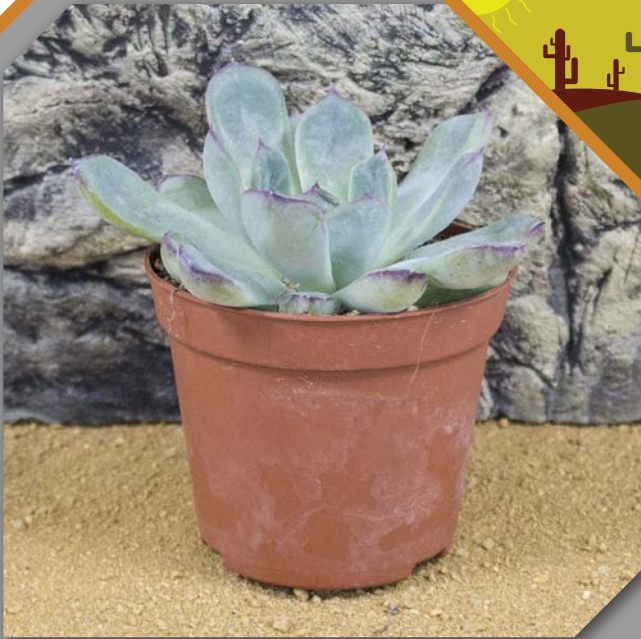
Mexican Firecracker - Echeveria setosa

Rosette forming plant for dry environment. Leaves are often hairy when small. Needs well drained soil. Drought tolerant but prefers to be kept slightly damp. Needs bright light.