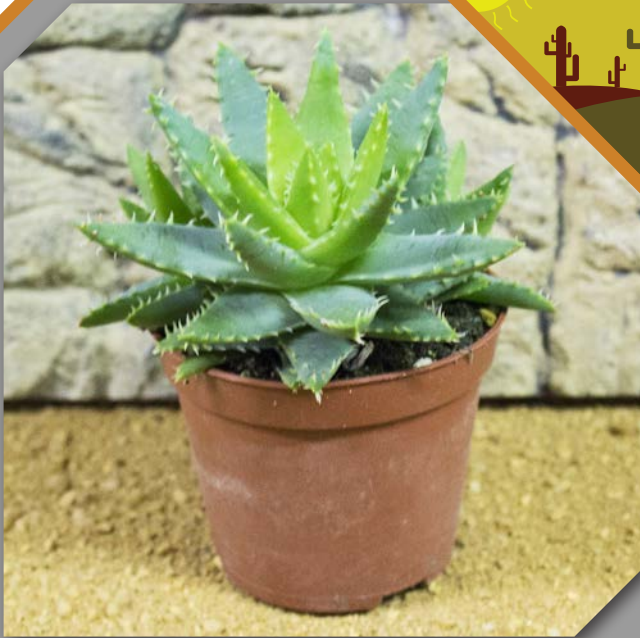
Short Leaved Aloe - Aloe brevifolia

A robust, clump forming Aloe for dry environments. Plant in well draining soil and keep roots slightly damp. Requires good light.