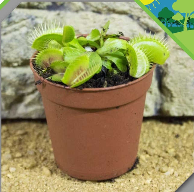
Venus Fly Trap - Dionaea muscipula

Needs very good light and soil that is permanently damp. Place pot in dish with 1cm of rainwater. Will not tolerate hard water. Keep cool in winter.