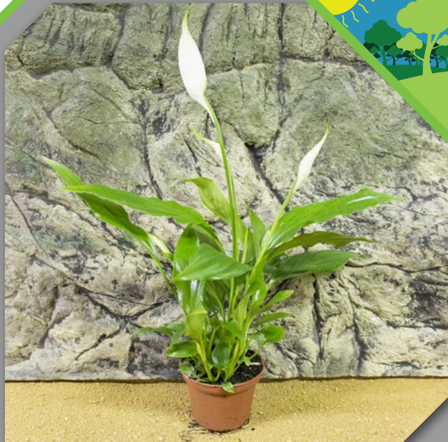
Peace Lily - Spathiphyllum

An upright, clump forming species which tolerates a wide range of light levels, moisture and humidity. Avoid extremes and protect from direct heat.