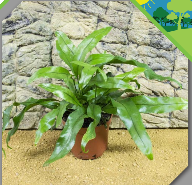
Kangaroo Paw Fern - Microsorium diversifolium

Epiphytic fern that needs high humidity. Tolerates low light.