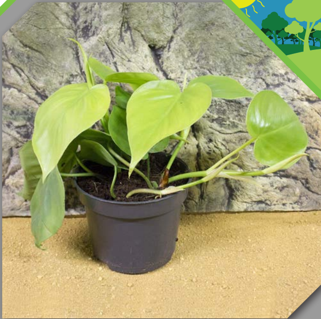
Heart Leaf Plant - Philodendron scandens

Rapid growing climber ideal for covering walls and branches. Needs moist conditions and will tolerate low light. Vigorous grower and may need cutting back.