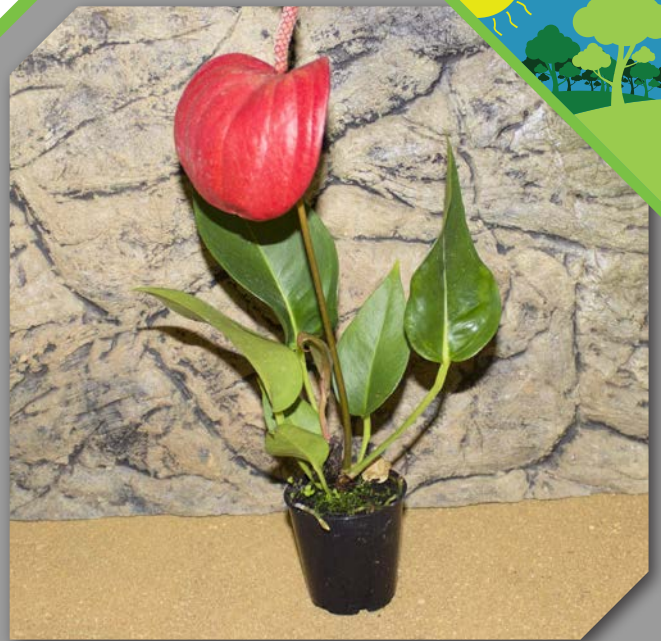
Flamingo Flower - Anthurium

Thrives in warm, humid conditions in an evenly moist soil it forms clumps of upright leaves and is an ideal background plant. Because it will tolerate shade or bright light then it can be used in many positions.