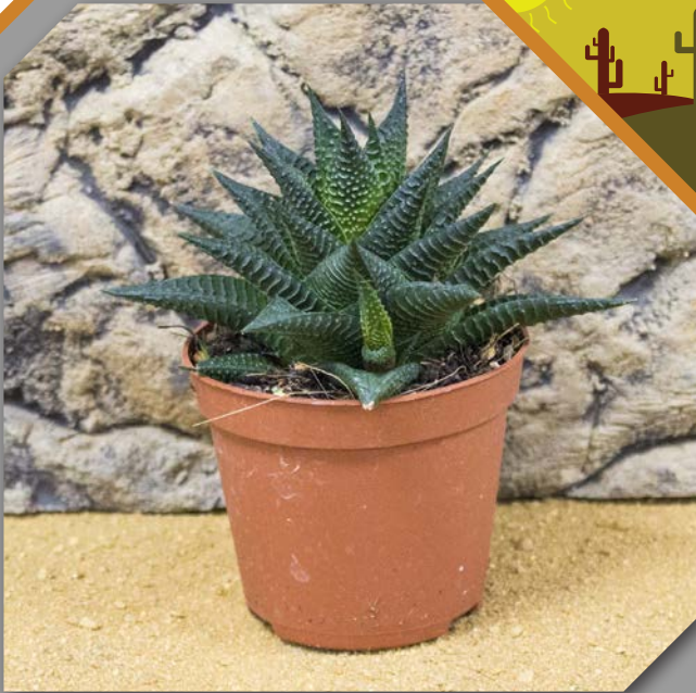
Fairies Washboard - Harworthia limifolia

Harworthia needs bright lighting, and a free draining soil but this species will tolerate some shade. Although drought tolerant they prefer to be watered as the soil dries out, but before they are completely dry.