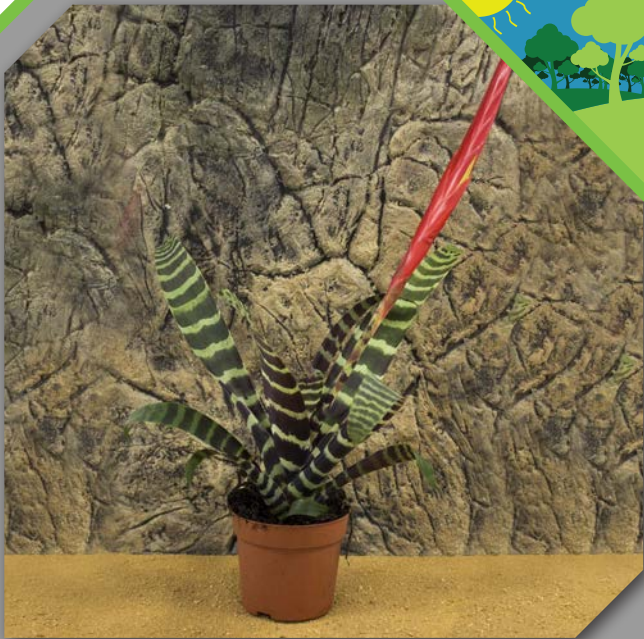
Flaming Sword - Vriesea (large)

Grown in bright light, but avoid direct, hot lamps which will scorch the leaves. Keep central well full of water. Need well drained soil and high humidity.