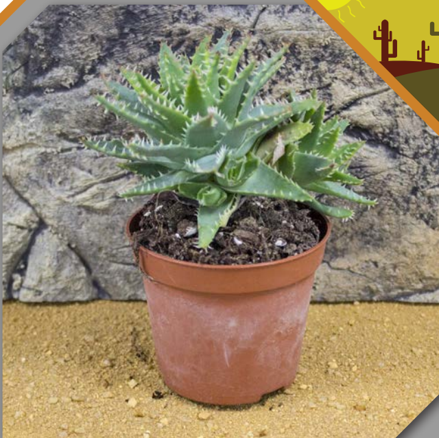
Gold Toothed Aloe - Aloe mitriformis

A robust, clump forming Aloe for dry environments. Plant in well draining soil and keep roots slightly damp. Requires good light.