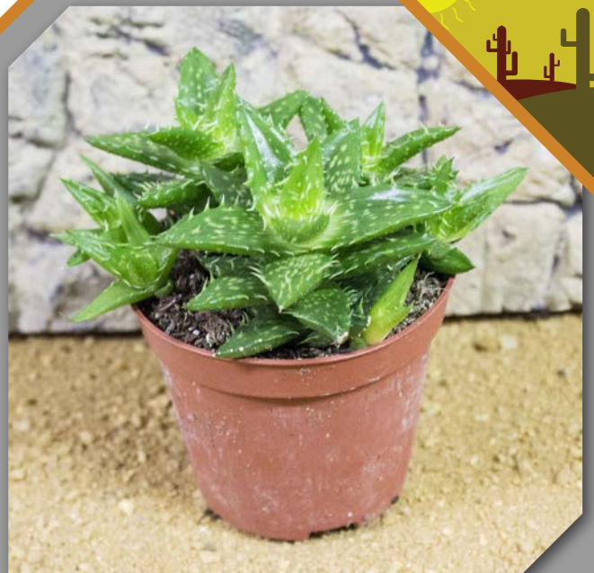
Socotra Aloe - Aloe squarrosa

A robust, clump forming Aloe for dry environments. Plant in well draining soil and keep roots slightly damp. Requires good light.