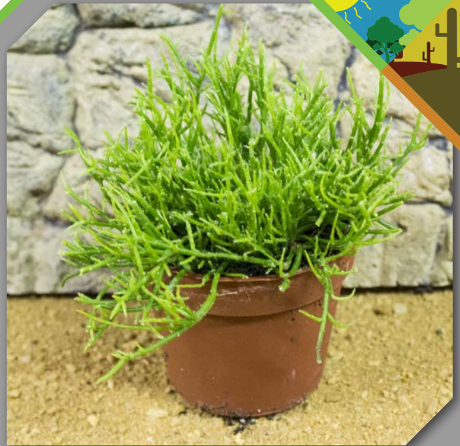
Mistletoe cactus - Rhipsalis cassuta

Epiphytic succulent cacti that can be grown in moist or dry terrariums. Avoid bright light and direct heat. In dry terrariums keep roots slightly damp.