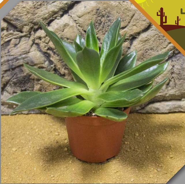
Reynold's Aloe - Aloe reynoldsii

Needs bright lighting and a well drained soil which prevents the roots rotting. Their leaves are designed to store water and so they are tolerant of occasional drying out, but this should be avoided if possible.