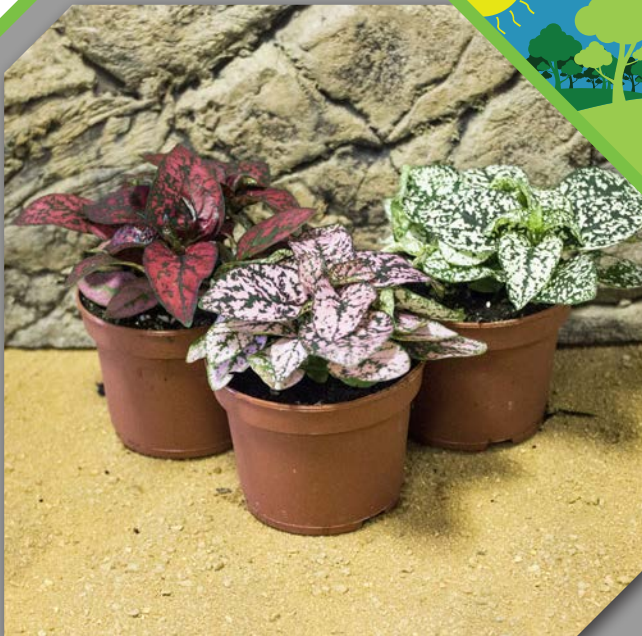
Polka Dot Plant - Hypostes mixed

Prefers low light conditions, and dislike bright, hot light. Most importantly the soil must be constantly and evenly moist and the humidity high, but with good airflow.