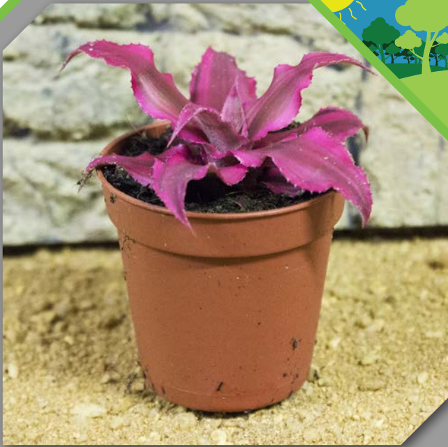
Earth Star - Cryptanthus Sp.

Unlike most bromeliads this species requires a shady position and a damp soil. Do not waterlog though or the roots will rot. Reproduces slowly from offshoots.