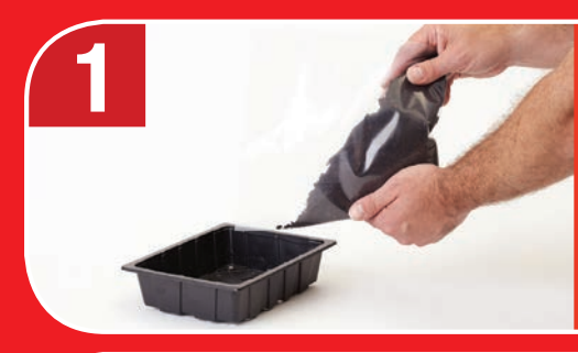
Open the bag containing the soil and carefully pour a quarter of the bag into one of the seed trays provided.