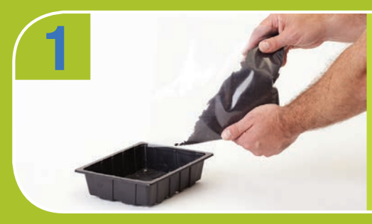
Open the bag containing the soil and carefully pour a quarter of the bag into one of the seed trays provided.